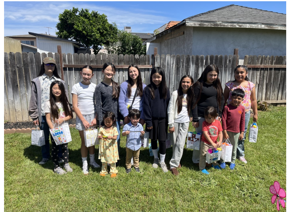
April 5, 2026 Easter Egg Hunt Event