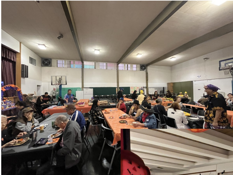
October 25, 2025 Annual Halloween Party