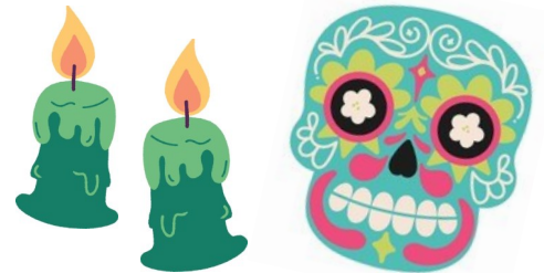
November 2, 2025 Celebrated Nitaya's Birthday