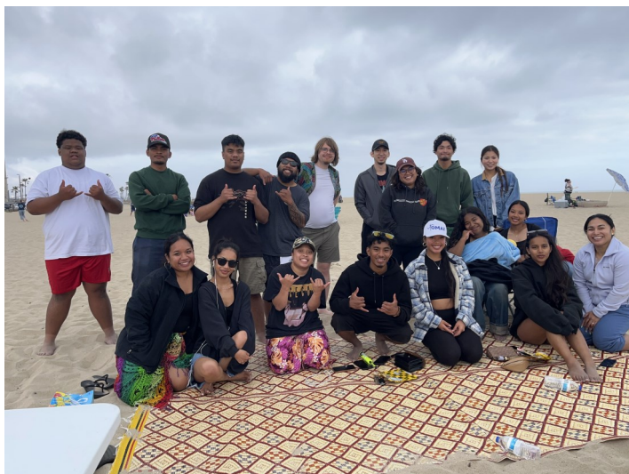
May 16 SoCal Youth/YA meet-up at Huntington beach (MPCC, MOUCC, LAFUCC, & Faith Community Church)