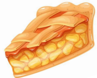
October 12, 2025 Pilgrim Pines "Apple Pie Day" Outing