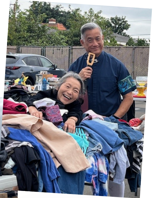
October 4, 2025 Rummage Sale