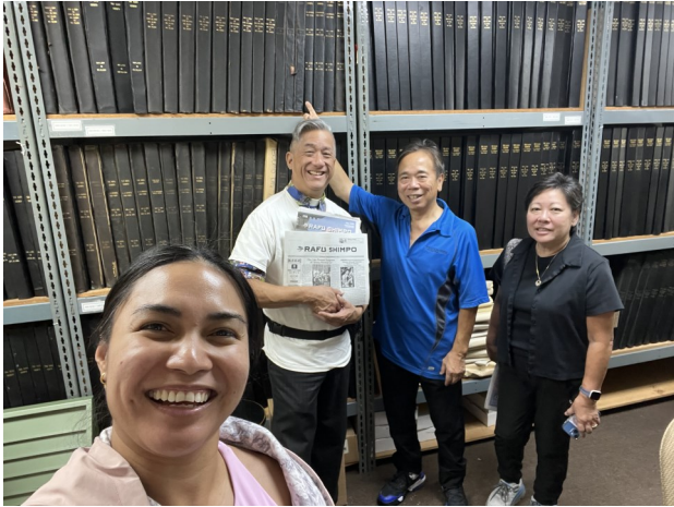
October 1, 2025 Visited the new location for Rafu Shimpo in Montebello