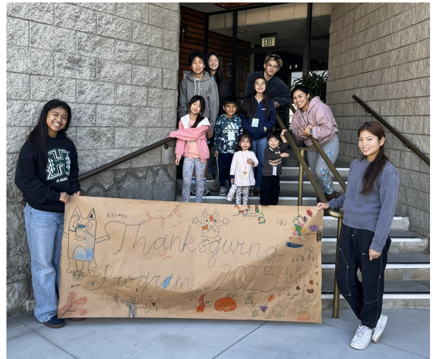
Thanksgiving Program (Nov. 27-29, 2025)