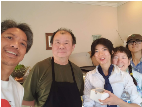
March 15, 2026 3K Cookie Walk Fundraiser for Summer Ex and our walkers stopping by Venecia Bakery for a treat