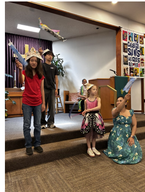
Father's Day Youth-led Service June 21, 2026